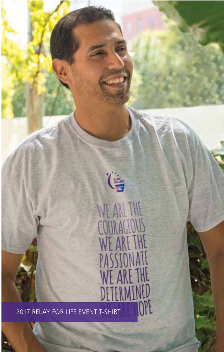
2017 RELAY FOR LIFE EVENT T-SHIRT